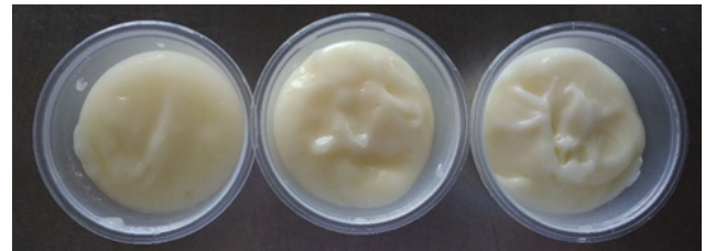
Figure 1. Aquafaba mayonnaise produced from different soaking times of aquafaba, (A) 12 h, (B) 18 h, and (C) 24 h.

The texture of mayonnaise samples was evaluated to determine its firmness, consistency, and cohesiveness. The mayonnaise produced by using the 24 h aquafaba sample showed good characteristics necessary for firmness and consistency (Table 3 and Figure 1). The cohesiveness for 24 h sample ( -61.42 \pm 2.11 ) demonstrated no significant differences to the other two mayonnaise samples. Liu et al. (2007) studied the texture properties of mayonnaise modified by using whey protein and determined the